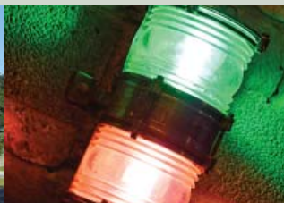
Surf n Turf