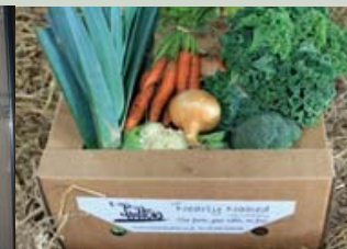
The Nearly Naked Veg Co