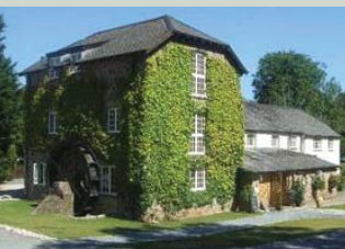
Turtley Corn Mill

Dear Veg Lovers, as we move further into the summer months so the variety of the boxes become more exciting, rather than a lack of vegetables in your diet you'll soon have to careful not to eat too many! The sun has been plentiful too which is a great help to the more established crops but sadly the lack of rain has caused the younger plants a lot of stress – yes, plants get stressed too! However with the good mix of weather promised over the coming month these same plants are already standing up in anticipation of happier days! Our rare variety of yellow and green courgettes are heading for great success and are available only to you along with our uniquely flavoured sugar snap peas and, of course, the best bunched carrots for miles! This is not forgetting all the salads you could need for the barbeque season. Here's an offer for all you Nearly Naked virgins, if you join our Box Scheme this month we will give you your fourth box free – just to say thank you, we are sure once you have joined you will never look back! Sam, Ben, Will & Cooper.