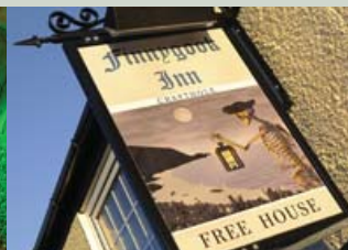
The Finnygook Inn