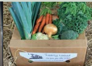
The Nearly Naked Veg Co